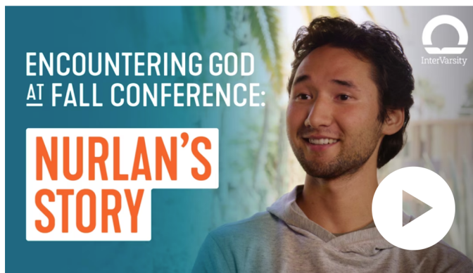
Gen Z finds faith for the very first time.

As we experience the joy of seeing our friends come to faith, we want other Christians to have this experience. We learn to teach others how to share their faith with friends.